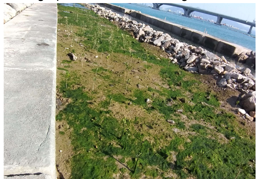
General View of Mangrove Eco-shoreline