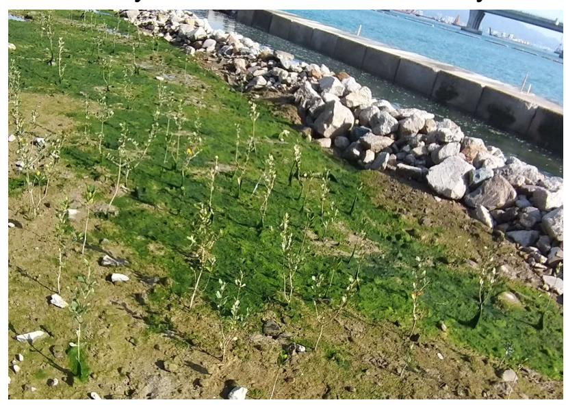
Close Up of Mangrove Eco-shoreline